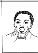
The Energy Yawn